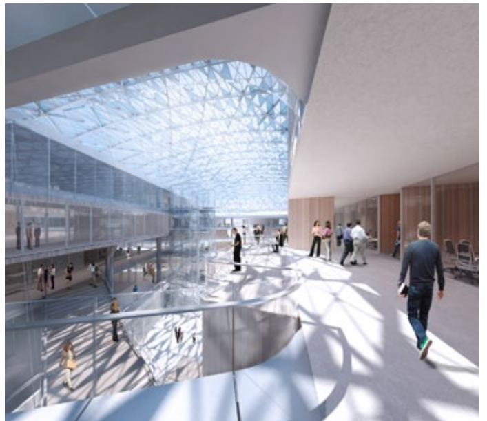
ADRIAN SMITH+GORDON GILL ARCHITECTURE