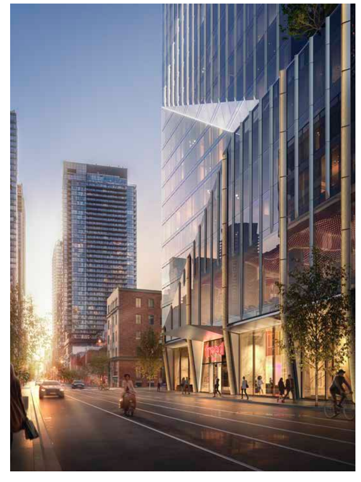
ADRIAN SMITH+GORDON GILL ARCHITECTURE