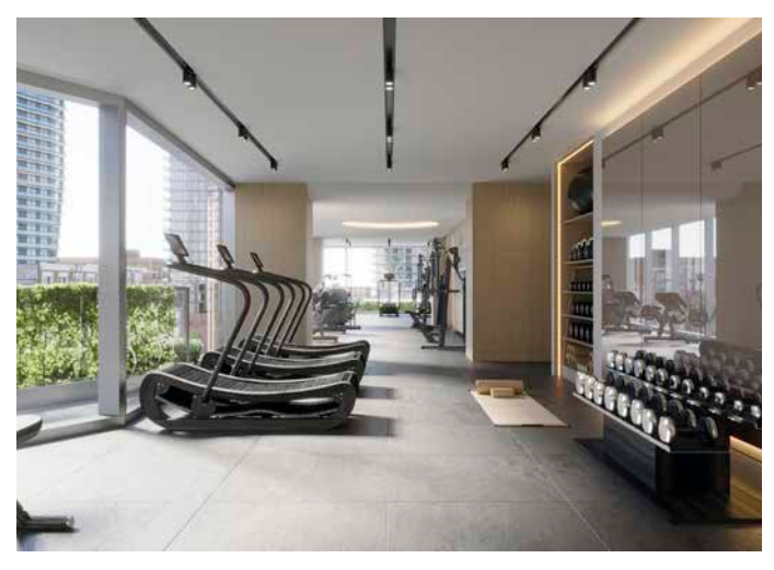
ADRIAN SMITH+GORDON GILL ARCHITECTURE