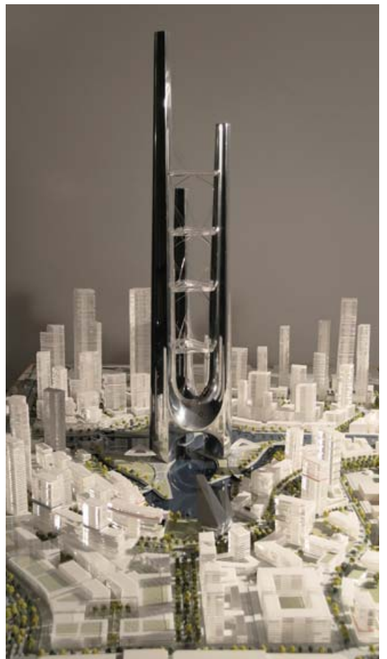
ADRIAN SMITH+GORDON GILL ARCHITECTURE