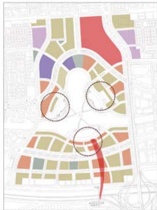
General Land Use Plan